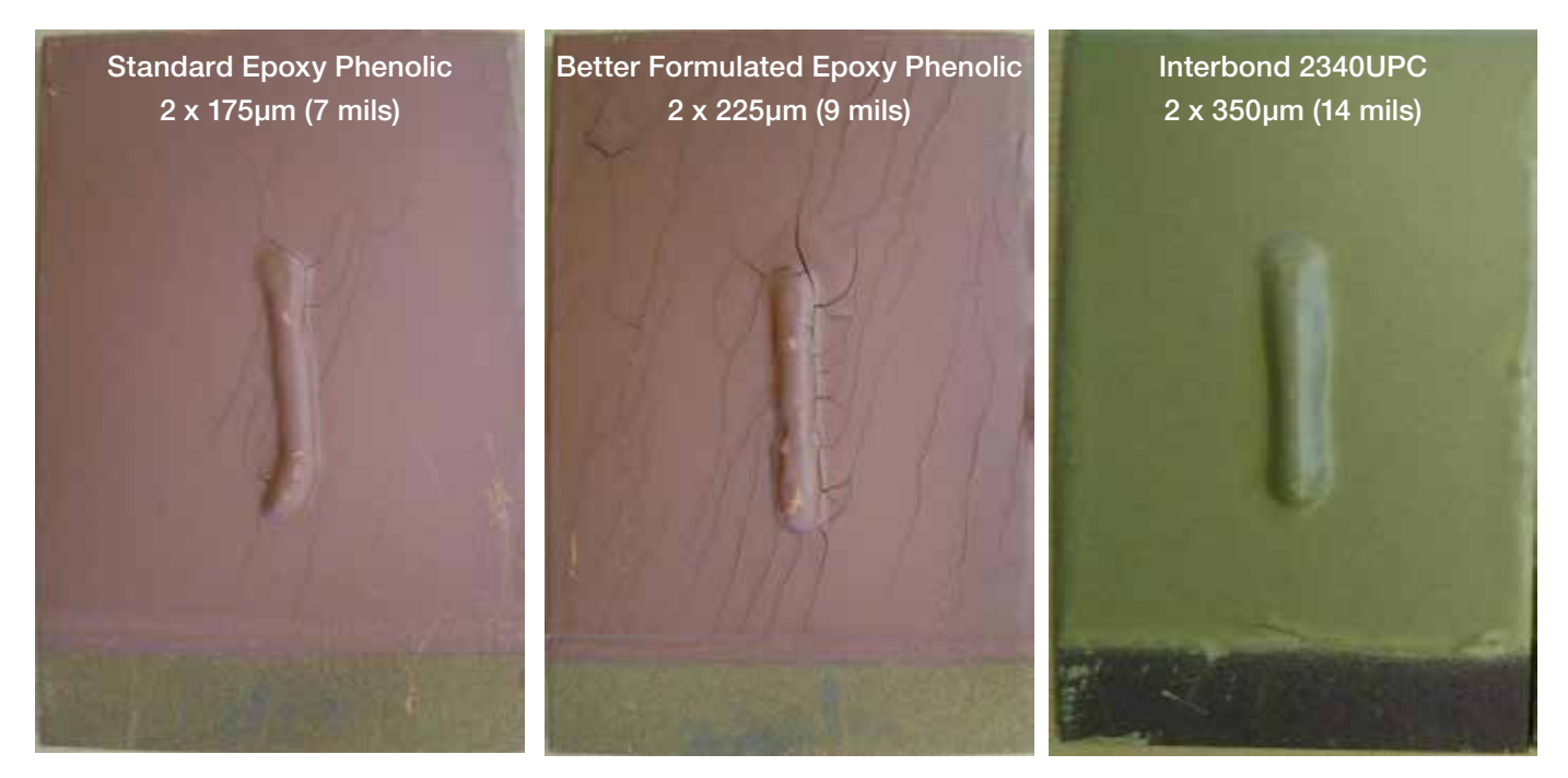
Fig 2 - Cyclic heat testing. Test consists of heating to 200°C (392°F) for 8 hours and then leaving to cool to ambient for 16 hours. Test repeated 5 times.

AAE technology delivers the right balance of superior properties for both the applicator and the asset owner, increasing confidence that the performance expectations inherent within the contract chain are delivered and helping to greatly reduce the risk of CUI. Delivering superb ambient temperature ISO20340 resistance, Interbond 2340UPC is a truly 'universal' pipe coating, allowing simplicity of specification and application, resulting in increased confidence for asset protection and improved application flexibility vs traditional coating solutions.