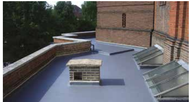
Intercrete 4885 is a single pack product, meaning no complex mixing on site

Problem: Ponded water on roofs can be a breeding ground for microorganisms and other bacteria. This can be particularly problematic where the roof is protecting a sensitive environment such as a hospital or school.