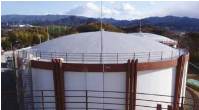
Intercrete 4885 is compatible with flat, pitched and curved roofs

Problem: Existing roof degradation due to the aggressive effects of weathering. Complex detailing requirements mean that specifying effective waterproofing can be particularly challenging.