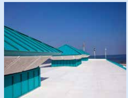
Intercrete 4885 is a waterproofing membrane that is ideal for use in a variety of roofing systems